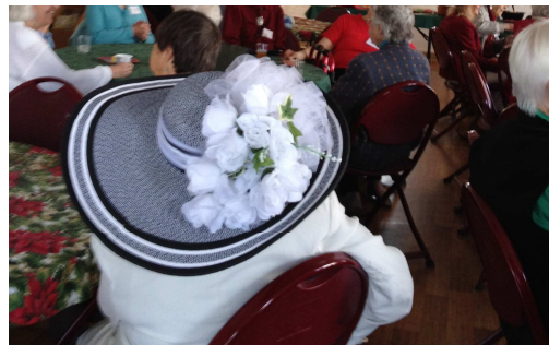
Guest with hat.