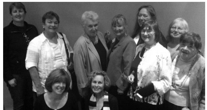
Hard working League board members end their terms at Annual Meeting.